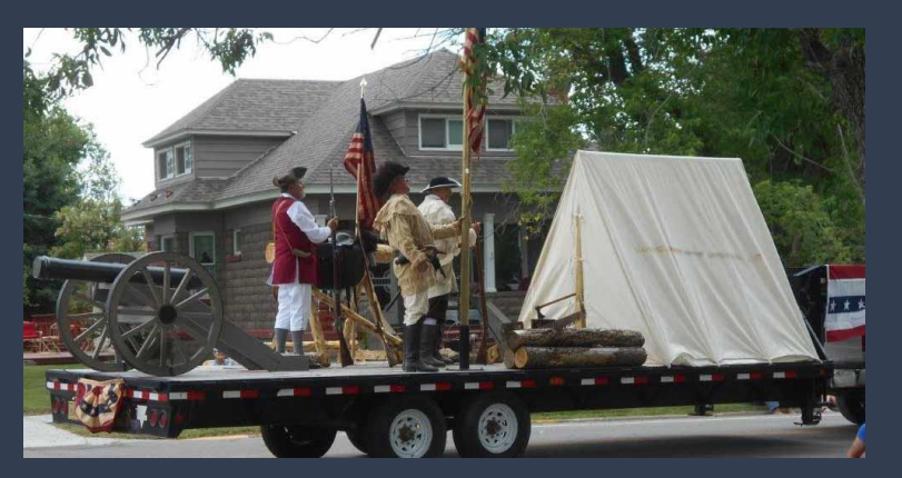
Everyone is enjoying the ride and having fun.