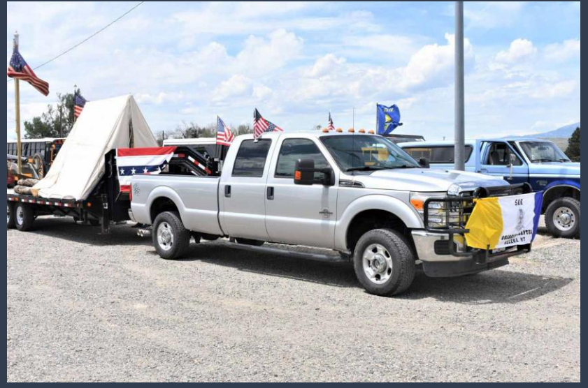
Don Reeds' pickup ready and outfitted to start the parade.