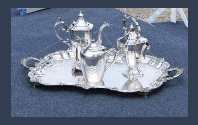
Donated Tea Service