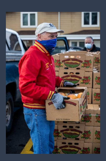
Composite picture of the Volunteers